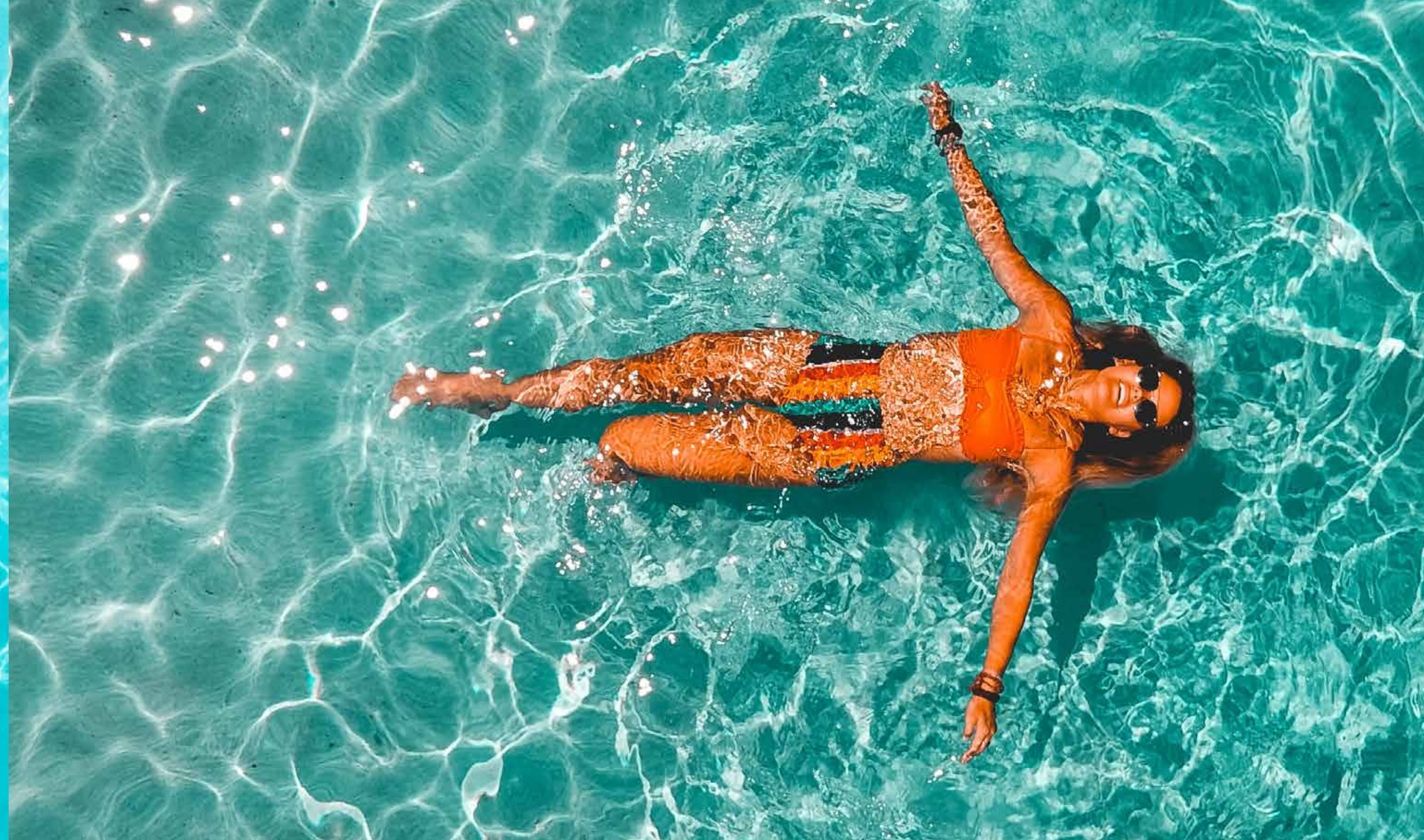
STEP INTO NATURE